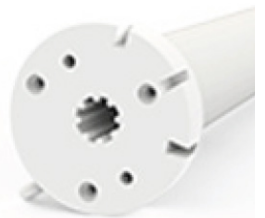
LS-100-RB (100 sq. ft.)