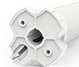
LS-150-300-RB (150-300 sq. ft.)