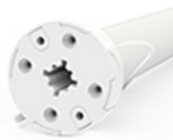
LS-50-RB (50 sq. ft.)